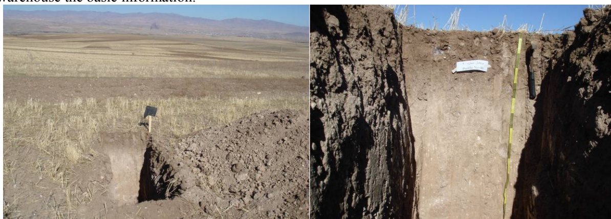
Figure 1. Site and soil profile described in the studied area (e.g. Clayey, mixed, mesic, semiactive Typic Calcixerepts with soil horizons A, B1, Bk2, C of a dark greyish brown colour on topsoil); Location: 38° 24'31"N and 47° 00' 58" E.

The study area covers 14 natural regions and includes 23 soil families within three soil orders: Entisols, Inceptisols and Alfisols in the north-west of Iran, east Azerbaijan province, in an area extension about 9000ha. Typic Calcixerepts are the most dominant subgroups (Figure 1). However, 44 soil mapping units were distinguished according to geo-pedology soil surveying (Shahbazi et al. 2009b). Altitude varies from 1300 to 1600m with a mean of about 1450m, and slope gradients vary from flat to more than 10%. The dominant farming system on the studied area is direct seeding on permanent soil cover in wheat- alfalfa-barley rotation. For this case study, the selected benchmark soil physical, chemical and morphological data were stored in SDBm plus which is a geo-referenced soil attribute database and engine of MicroLEIS DSS. On the other hand, the climate database CDBm and farming database MDBm are used as important software to warehouse the basic information.